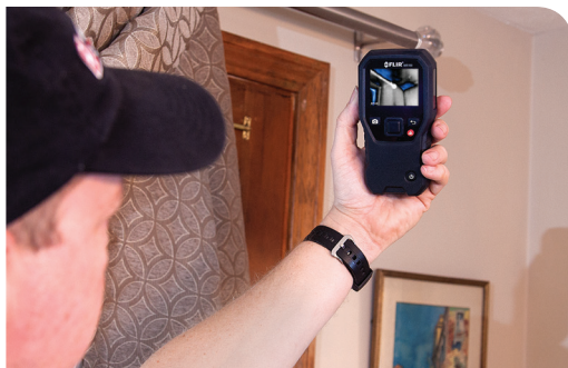
Scanning ceiling & wall joint for moisture issues