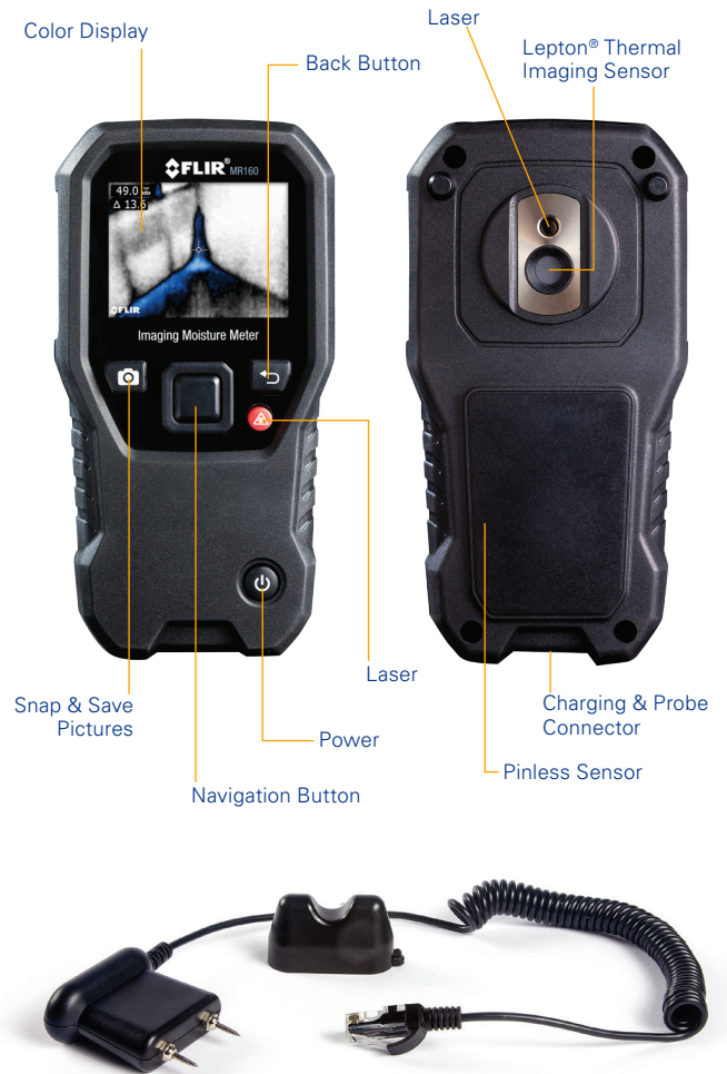
MR02 Pin Probe included

PORTLAND Corporate Headquarters FLIR Systems, Inc. 27700 SW Parkway Ave. Wilsonville, OR 97070 USA PH: +1 503.498.3547